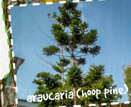
araucaria (hoop pine)